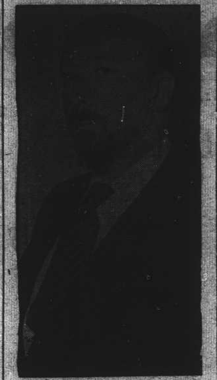
BOLIVIAN PRESIDENT —Seldom photographed, President Urriolagoitia of Bolivia is pictured in the executive offices at La Paz.