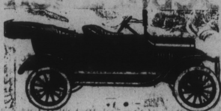
1922 FORD TOURING, VALUE $490.00 PURCHASED FROM AND ON DISPLAY AT THE M. O. SUMMERLIN GARAGE, MOUNT OLIVE