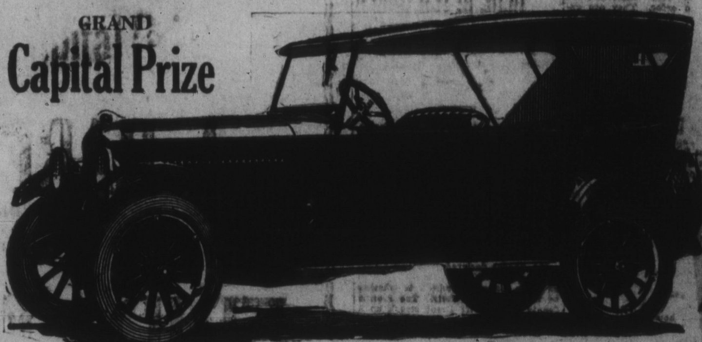
1922 Model Studebaker Special Six; value $1750.00. Purchased from and on display at Brown Auto Supply Co. Equipped with extra cord tire, tube, motor meter radiator cap, sun visor, front and rear bumper, tire cover and other extras