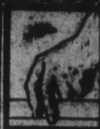
Help (To Do)