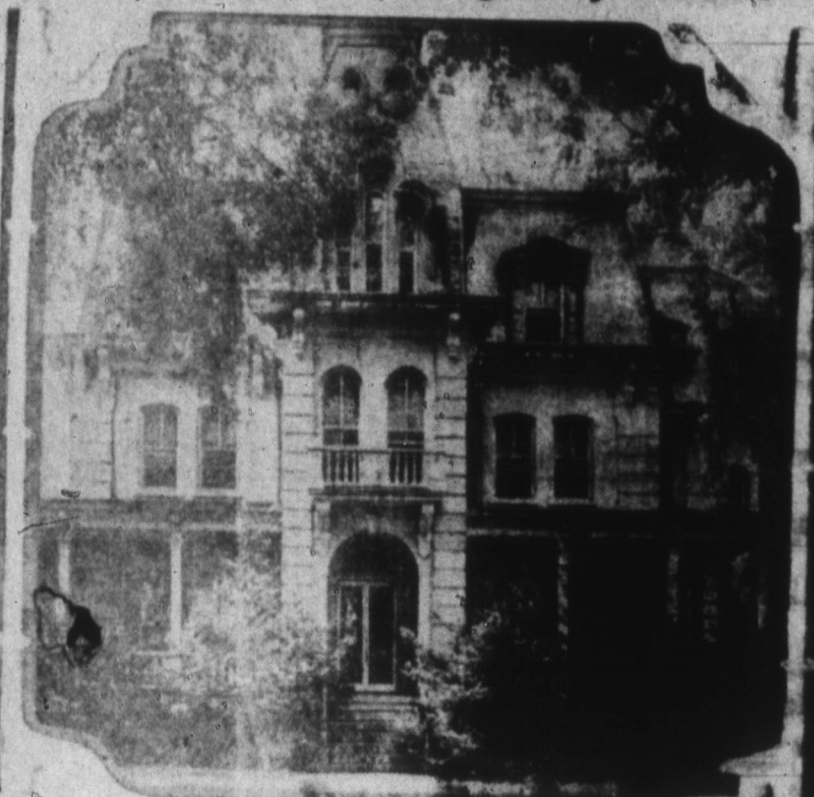
Former President Wilson is said to have purchased this old Virginia home, located in Fairfax county, Va., his native state. The mansion is between Leesville and Tysons Corners, about ten miles west of Washington.