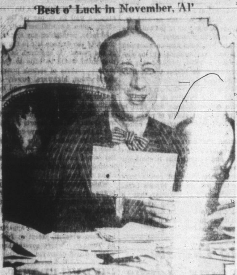
Thousands of telegrams, letters and telephone calls have reached Governor Alfred E. Smith since he was nominated for president by the Democratic convention. He is pictured at his desk in the executive mansion, reading a portion of his bulky mail.

47,000,000 Pints a Year Southern Dairies "Health Builders of the South"