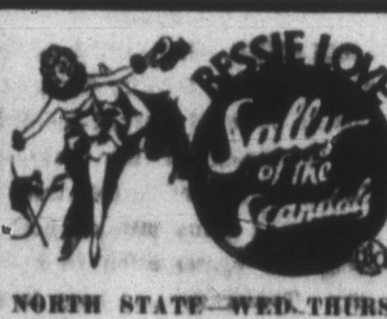
NORTH STATE—WED. THURS