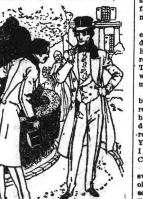
"BECAUSE YOU HAVE THE HONOR TO KILL THAT CAMEO KIRBY."

"Ah," exclaimed Mr. Randall, closely scanning the other, "you're the gen-