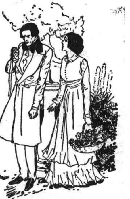
"YOU KNEW MY FATHER?"

She turned, asking the question with wondering eyes, her face transfigured.