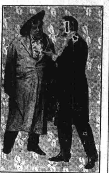
"IT WAS THE ANGEL OF CHANCE WHO GAVE ME THE NAME."

"A coolin' draft," he echoed, with violent scorn. "I want a drink, and let it be strong, friend. I always knowed you was a fool, Gene Kirby, but I never knowed it was as bad as this. All the names in the