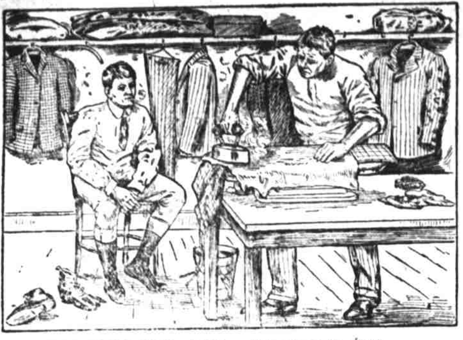
THE OTHER SHOP-Waiting while you press (pire).