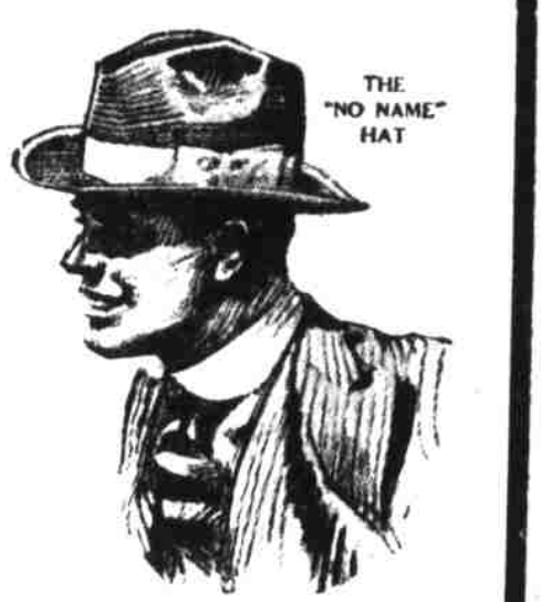
THE "NO NAME" HAT