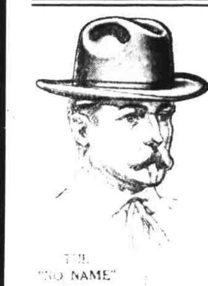
THE "NO NAME" HAT

Men's John B. Stetson hats, all the new Spring shades, African Brown, New Grays, Greens, etc. are ready for your inspection.