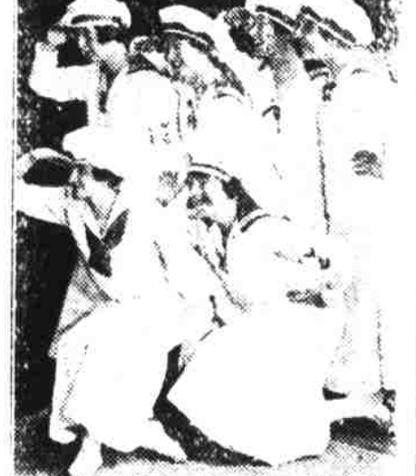
THE NAVY GIRLS.

The Navy Girls' entertainment opens with the girls, in gypsy costume, seated as if around a campfire and singing the gypsy chorus from Carmen.