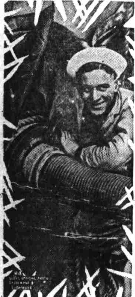
Coaling Ship in Modern Style.

the point of view of commercial profits, as a coal user, and experts have said that by using oil the expenses of fuel will be enormously cut.