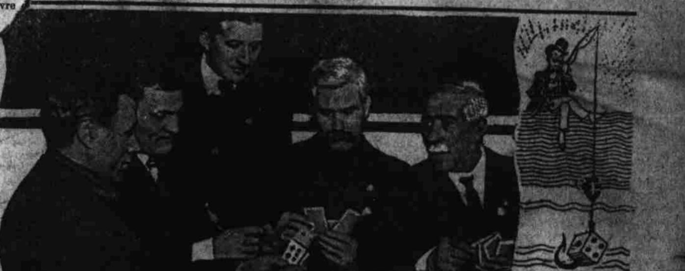
A FRIENDLY GAME Until Some Professional Gambler "Spots" It and Takes a Hand

The migrant worker has none of the protections of Society. He has no home. No community stands behind him. No organization sees that he gets fair play. He is the prey of the gamblers, the crooked politicians, the police stool pigeons and the yeggman. He is a worker-outcast. The Interchurch World Movement is now making a survey of his problems to bring about a closer co-operation of the churches of America in its solution.