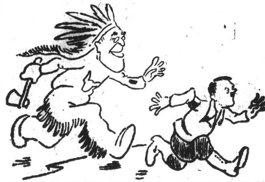
CIRCULATED UNDER NAZI NOSES by underground groups, this cartoon has been spread throughout occupied Belgium. Translated, the caption reads: "Running away is only the beginning—you can't escape my scalping you." This is typical of countless devices employed by patriots of Belgium and the other occupied countries of the United Nations to harass Axis authorities and troops.

The 173 fires reported during 3.20 January burned over 5,875 acres