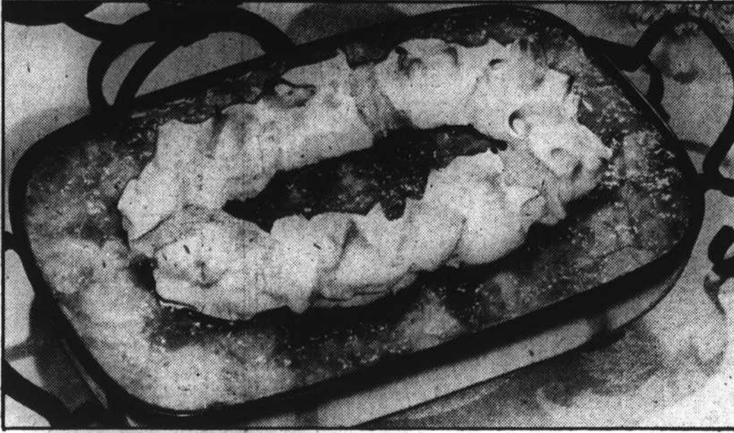
Orange Marmalade Bread Pudding adds zip to party dinner and is easy to make.

In a large bowl, beat 3 egg yolks and 1 egg white. Reserve remaining 2 egg whites for meringue. Gradually stir in milk, blending well. Then stir in butter, 1/2 cup of the orange mar-