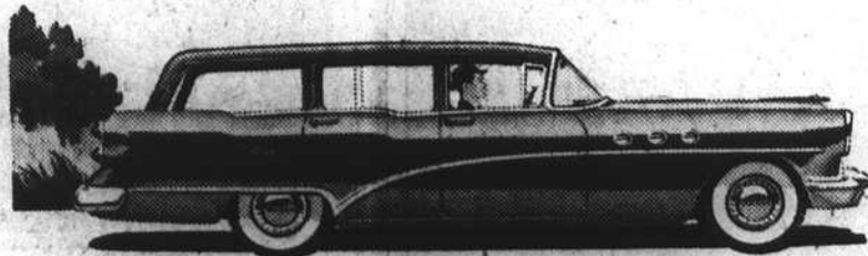
The sensational Buick Century is available for 1954 in a full line of models, including the completely new all-steel 4-door, 6-passenger Estate Wagon shown here.