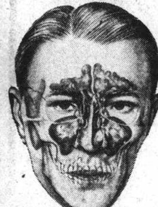
GET PALLIATIVE RELIEF WITH TRUMAC TABLETS

5 Miles South Of Goldsboro - On U.S. 117