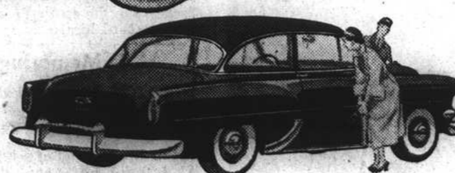
The "Two-Ten" 2-Door Sedan

Other low-priced cars don't offer these advantages. Chevrolet does!