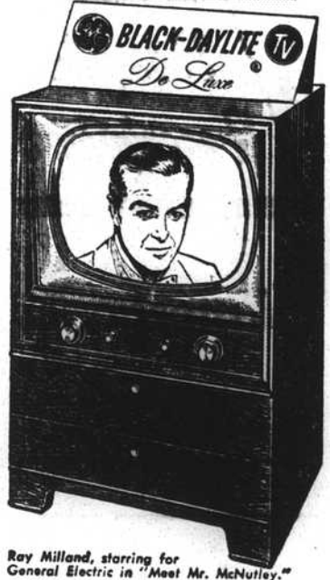
Ray Milland, starring for General Electric in "Meet Mr. McNulty," Model 21T26. 21-inch table model. Genuine mahogany-veneered—oak wood cabinet. Base extra.