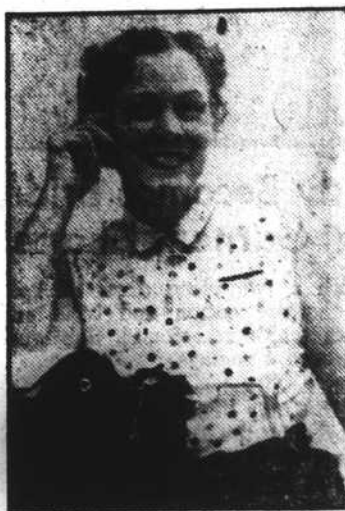
SHE STILL SHINES —Esther Ralston, blonde beauty of the silent screen, who was known as "the American Venus," is now Mrs. Esther Lloyd, a grandmother, and the one-woman office force of the Seventh Church of Christ, Scientist, in New York City.