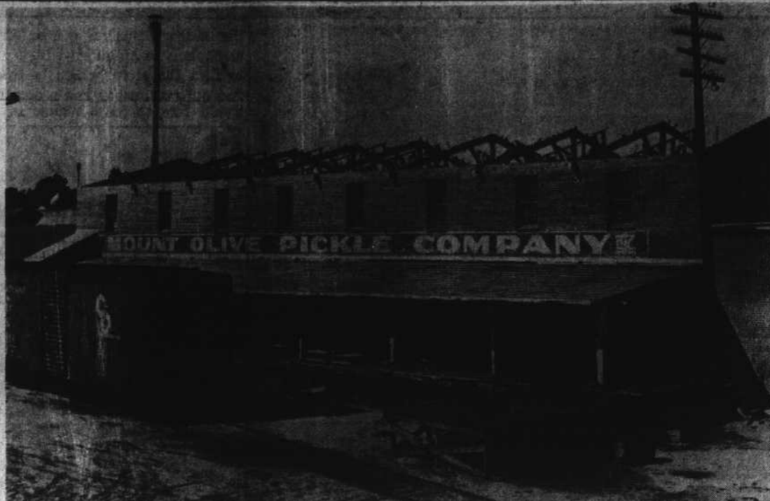
ROOFLESS —This is what Hurricane Hazel, which struck in this area Friday, did to the roof of a storage house belonging to the Mount Olive Pickle Company. It took the roof, intact, and blew it out across the railroad tracks.