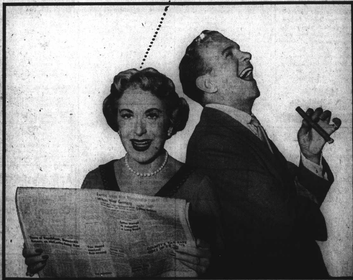
See the Burns and Allen Show Monday 8:00 P.M. on the CBS TV Network

Well, they could be coming out with a seven-cylinder car!