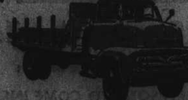
NEW higher power and compression in all light and heavy duty series Ford Trucks! Show C-400 Cab Forward, GVW 14,000 lbs. Choice of two proven V-8's.