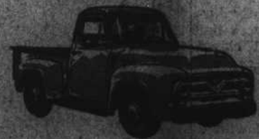
NEW Payload Champ of the Pickup! New Ford F-100 6 1/2-ft. Pickup, GVW 5,000 lbs., now takes payloads up to 1,718 lbs. 132-h.p. V-8 or 118-h.p. Six engine.

NEW axle capacities and new springs, coupled with Ford's high-payload construction, make Ford Trucks better load carriers than ever. Ford's new 1/2-ton Pickup, for example, has one of the biggest payload capacities of any Pickup: 1,718 lbs. Ford gives you top payload capacities in over 190 models, ranging up to 60,000-lb. GCW tandem-axle giants.