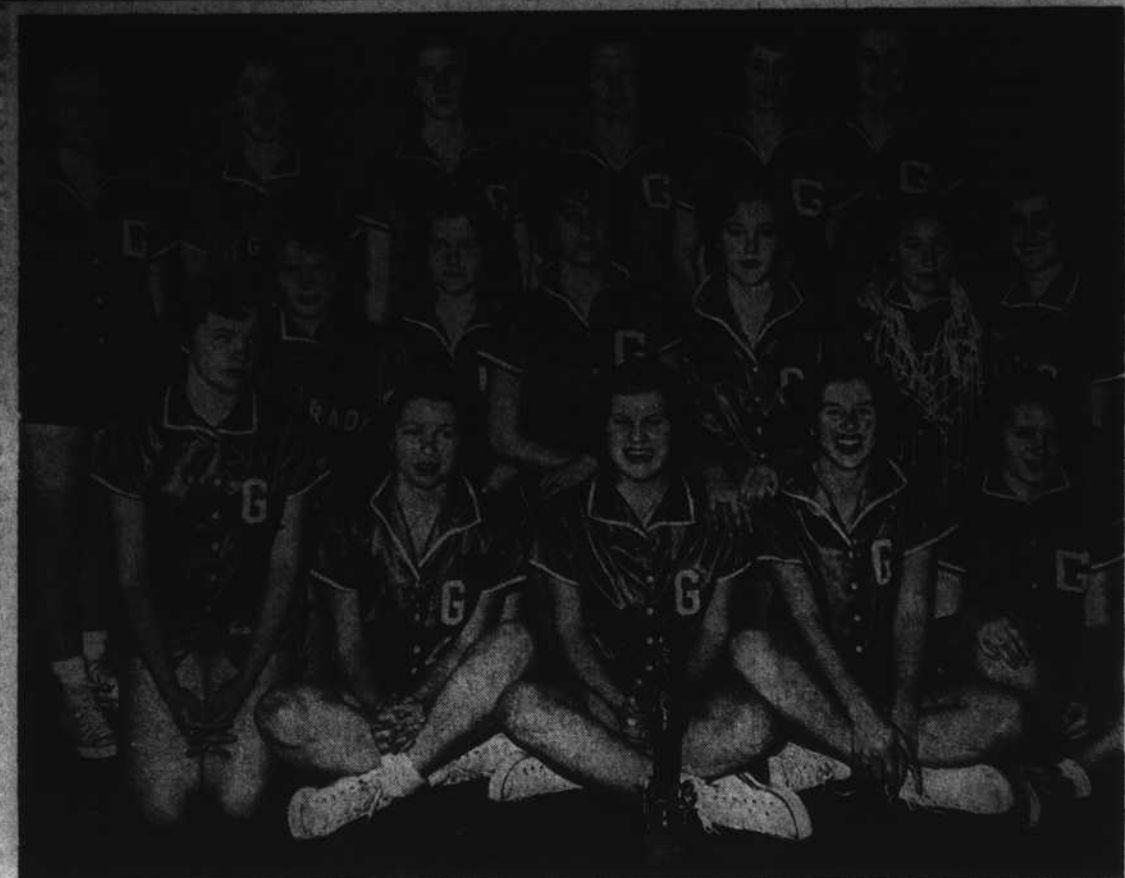
CONFERENCE CHAMPIONS — The B. F. Grady girls' basketball team finished first in the Duplin basketball standings and to prove it was no accident won the conference tournament, defeating Calypso, 72-70, in the finals Friday night. In the above photo, members of the championship team are shown with their trophy. They are, left to