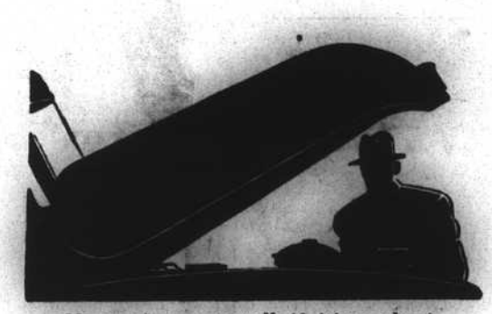
How can you tell if it's a shortstroke engine? The "stroke" is always as short as, or shorter than the "bore Check the specifications! Get the facts!