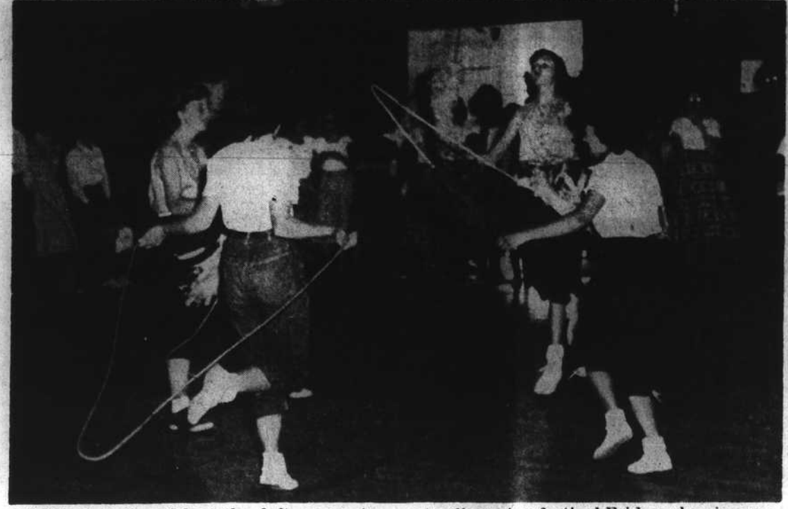
JUMP! —But the girl at the left seems to be having trouble with her rope, as members of the ninth grade at Faison put on a rope-jumping act in connection with the school's spring festival Friday, showing parents and friends of the school some of the things learned in physical education during the year.

school's spring festival Friday, showing parents and friends of the school some of the things learned in physical education during the year.