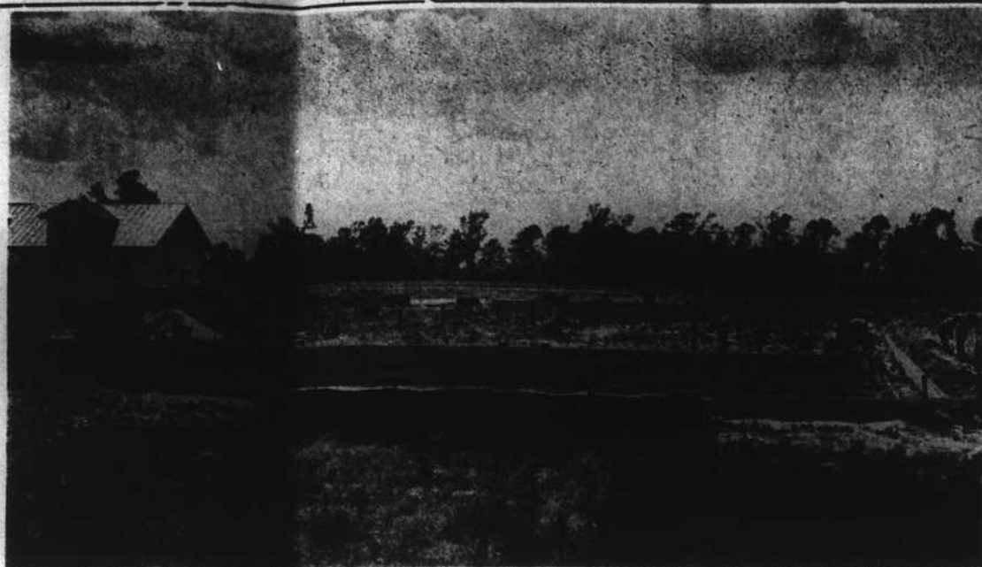
MORE CLASSROOMS — A combination classroom-gymnasium goes up at Carver school. One of three buildings now being erected on the school campus, it is expected to be completed later this year.

Wednesday, June 8, Tribune vs Calypso; Friday, June 10, Jaycees vs Rotary; Tuesday, June 14, Legion vs Tribune; Thursday, June 16, Rotary vs Tribune; Friday, June 17, Legion vs Calypso; Tuesday, June 21, Legion vs Rotary; Friday, June 24, Jaycees vs Calypso; Tuesday, June 28, Tribune vs Jaycees, and Thursday, June 30, Calypso vs Rotary.