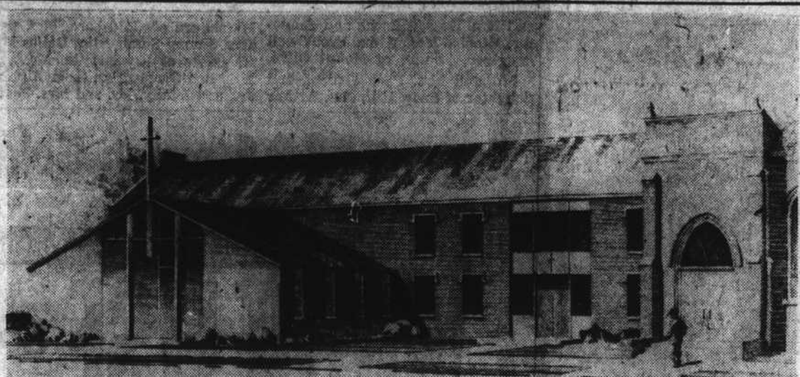
CHURCH'S EDUCATION PLANT — The above picture is an architect's drawing of the education building adopted by the First Baptist church, of Mount Olive. A fund-raising campaign is underway. Estimated cost of the building including furnishings is $150,000.