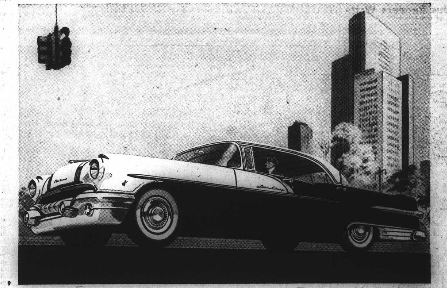
STAR CHIEF 4-DOOR CATALINA