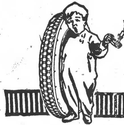
Time to Re-tire? (Buy Fisk)