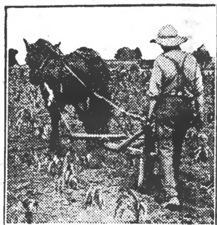
The One-Horse Cultivator Illustrating Waste of Man-Labor Actually Entailed by Using Small Implements.

With a 28-inch horse-drawn plow, one man accomplishes from 70 to 80 per cent more than with a single-bottom plow. One man with a 28-inch plow drawn by a tractor covers from 80 to 35 per cent more ground in a day than does a man using six horses