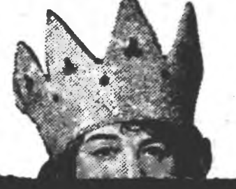
Miss Campbell is "Miss America" crown which she has won on two occasions.

"I have taken TANLAC and I do not hesitate to say that it is a wonderful health-giving tonic. It has brought relief and good health to many women, and with good health one may have a measure of beauty that will overcome shortcomings in face and figure.