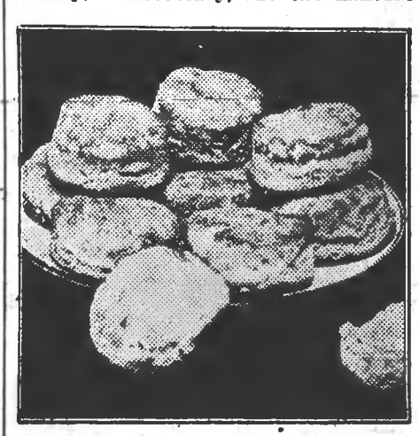
Plain Baking-Powder Biscuits.

Sift together the flour, salt, and baking powder. Cut or chop the shortening into the flour with one knife or two, until well distributed. Finally, if necessary, rub the mixture