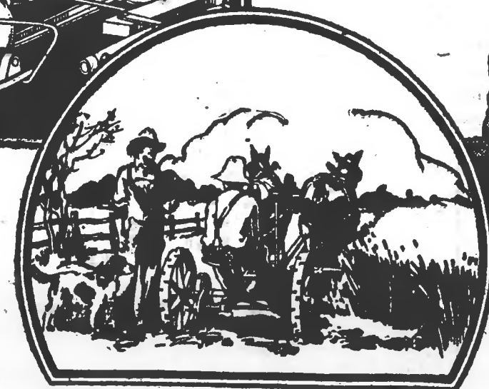
THERE IS NO SUBSTITUTE FOR EXPERIENCE

The PITMAN is Steel ~ One Piece! An AVERY PLUS Feature