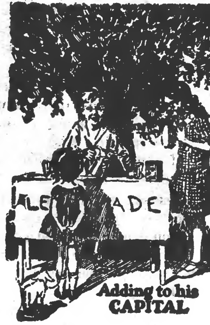
Adding to his CAPITAL

often asserts itself early in life. It should be encouraged---never discouraged.