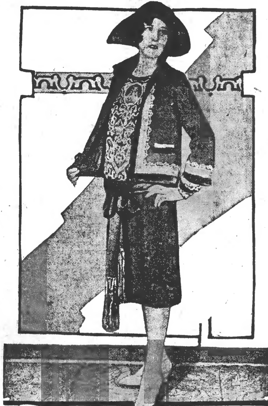
Featuring Bolero Styling.

So it is, that no material is too elegant, no color too extreme, no decorative feature too elaborate for the styling of the modern pajama. Recently the mode has taken a turn for long straight trousers of tailored