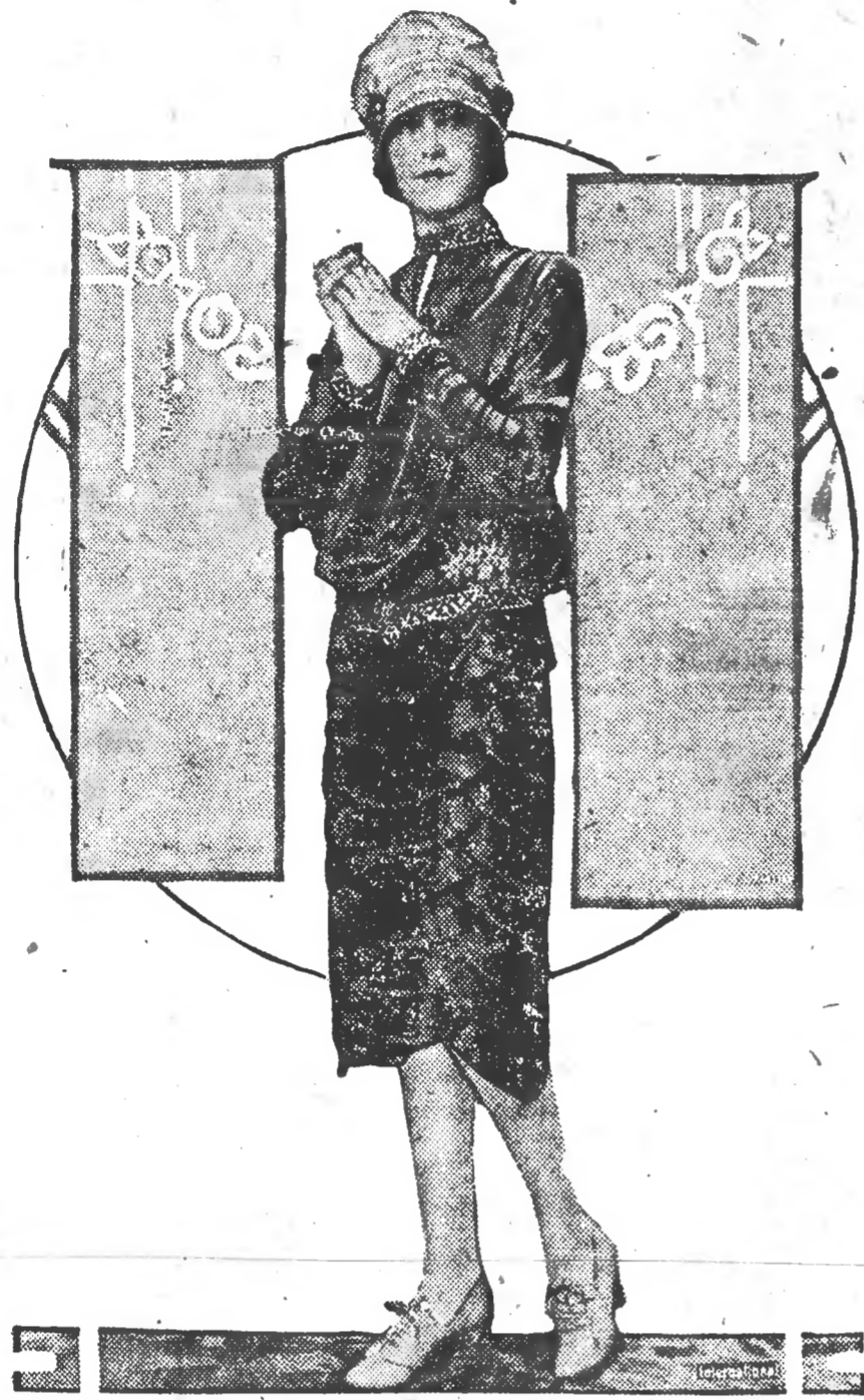
OF DISTINCTIVE MODISHNESS

The fact that the ensemble theme is preeminent in the mind of the stylist this season, accounts for the being of the handsomely designed group in this picture. This adorable set is of ebony kidskin—the new name Paris has given to black kid. With the revival of the vogue for fabrics in black, it is natural to foresee the incoming of the mode for black shoes. Ebony kid in its deep dull luster is considered far smarter than the leather of high gloss. Here we have a naive hat of ebony kid with a narrow turn-back of gray snakeskin. The flat envelope purse is displayed in two views. The one in the inset shows the handsome front flap which is embellished with a conventional perforated design, the same