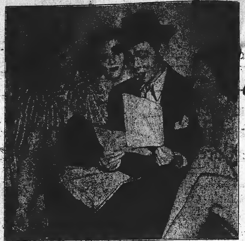
Made up for his title role in "Citizen Kane," Orson Welles takes time out from acting duties to talk over forthcoming action with chorus girls who dance in the film. Welles, besides acting, is also producer and director of the RKO Radio picture.

IT PAYS TO ADVERTISE IN THE NEWS-JOURNAL—TRY IT!