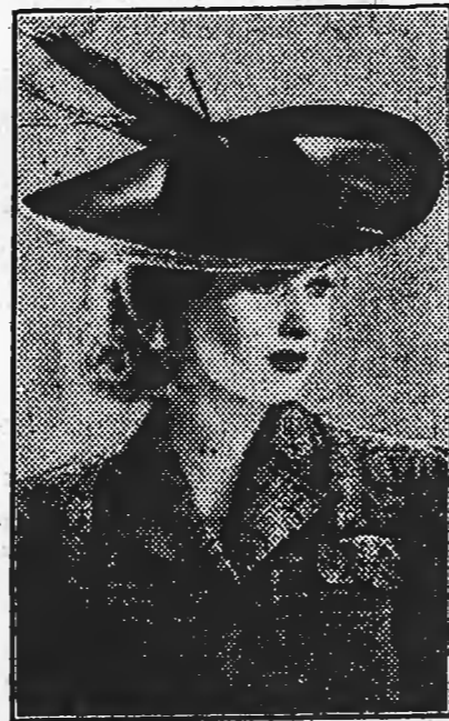
CAPTIVATING CLIMAX to her ensemble is this dashing hat worn by Lucille Ball, RKO Radio star now teaming with George Murphy in "A Girl, a Guy and a Gob." Far-reaching pheasant quills pierce its shallow crown of very dark brown, while the sweeping brim is faced with the tweed of Lucille's fitted coat of browns and turquoise.

666 Liquid or 666 Tablets with 666 Salve or 666 Nose Drops generally relieves cold symptoms the first day. —Adv.