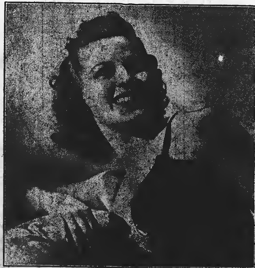
One of the screen's most attractive and talented young actresses is Jean Rogers who plays the romantic lead opposite Bob Crosby in "Let's Make Music." Blonde and blue-eyed Miss Rogers is a little over five feet five inches tall.