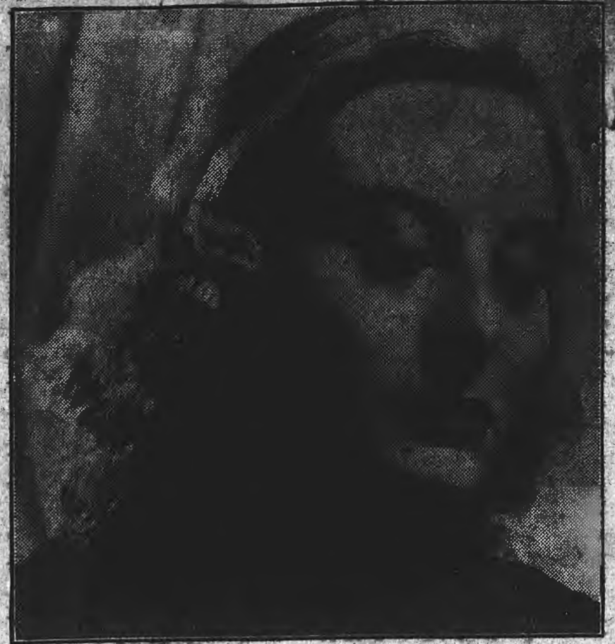
Michele Morgan, one of the most popular feminine film stars of France, is now in Hollywood where her exotic Gallic charms will be brought to the screen in RKO Radio productions. Fascinating and blonde, Miss Morgan is best known in this country for her outstanding portrayal in "Port of Shadows." She also co-starred abroad with Charles Boyer in "L'Orage" ("The Storm").