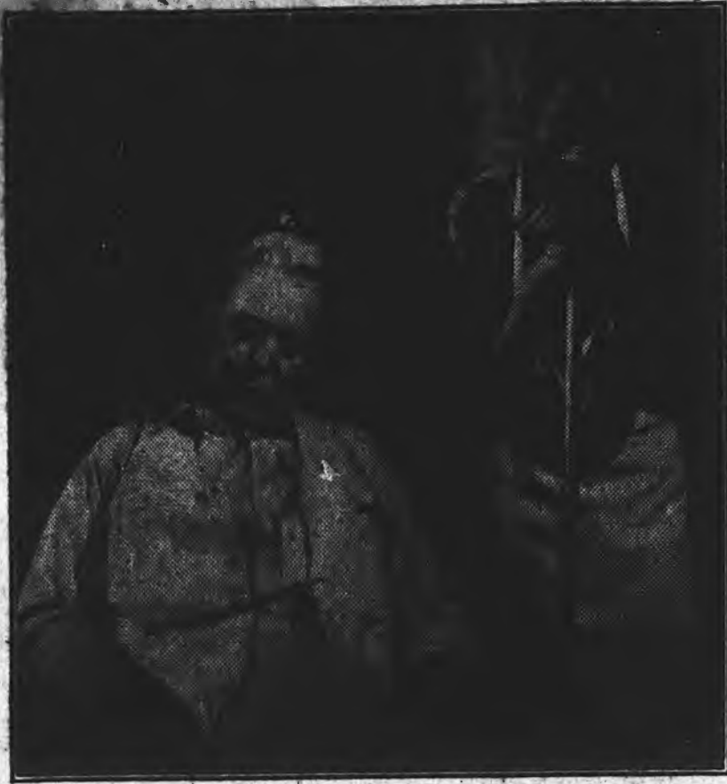
Evidently the fictitious town of "Coldriver" has adopted the siesta custom, as witness "Scattergood Baines" (Guy Kibbee) and his ne'er-do-well assistant "Hipp" (Willie Best). The Clarence Budington Kelland character now comes to the screen in a series of features of which "Scattergood Baines" is the first.