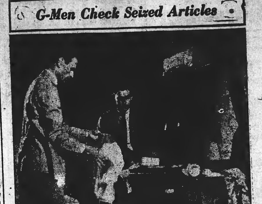
All contraband seized from enemy aliens is carefully gone over in the F. B. I. laboratories in Washington, D. C., says The March of Time in "The F. B. I. Front." Hidden evidence is often exposed by such modern technical apparatus as black light, and the most innocent article may contain valuable information or even dangerous explosives.

The Army mule, long a standby for drawing escort wagons and other vehicles but rather generally replaced a few years ago by motor transport, is now making a remarkable come-