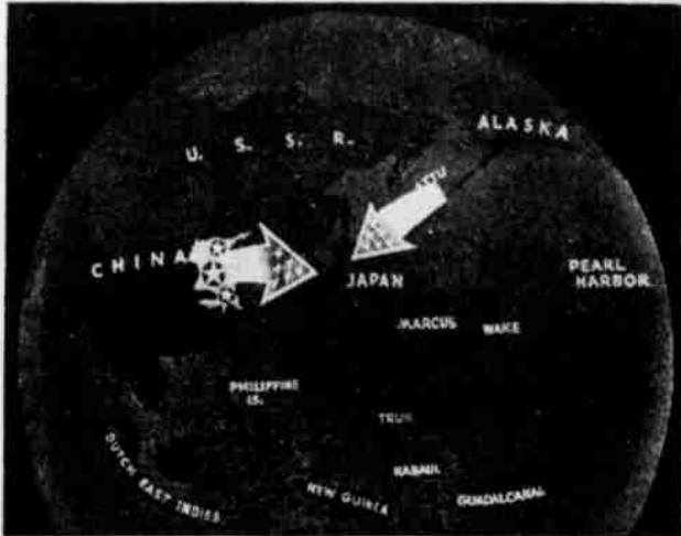
Reopening of overland supply to China rolling back the Japanese to the coast, thus providing air bases from which Japan could be blasted from the West, while long range bombers strike at her from the Aleutians.