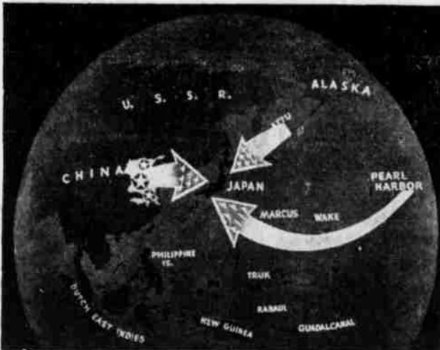
Combined attack. Naval sweep from Hawaii and other Pacific bases aimed to coincide with bombing from China and the Aleutians.