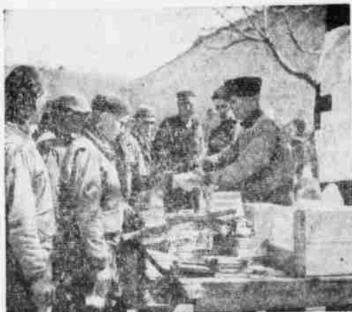
FIELD SERVICE AT THE FRONT! Wherever your soldier goes, the Red Cross goes, too. Field Directors distribute toilet articles, writing paper, cigarettes to men near the front lines. They maintain contact between these men and their families. In one month in 1944, Field Directors relayed over 31,000 emergency messages.