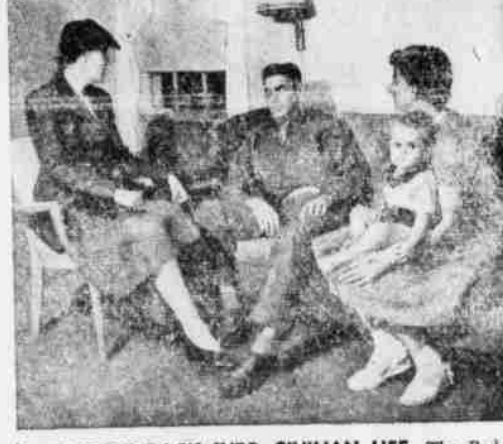
WELCOME BACK INTO CIVILIAN LIFE. The Red Cross provides special information and help for disabled veterans. The Red Cross answers questions about pensions, claims, vocational rehabilitation training. It is authorized to present veterans' claims. The Red Cross is at his side—always—now and after the war.