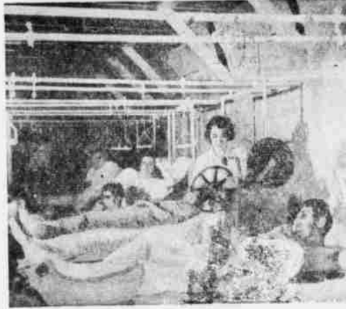
MOVIES IN A HOSPITAL WARD! Mickey Mouse and the latest Hollywood releases do wonders for a fellow with a leg full of shrapnel! And so do books, games, song-fests — stock-in-trade of Red Cross Recreational Workers at home and overseas. Your Red Cross lifts spirits and speeds up convalescence!