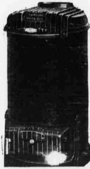
Coal or Wood Heaters