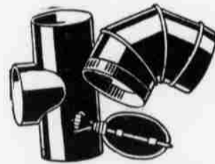
Stove Pipe & Fitting