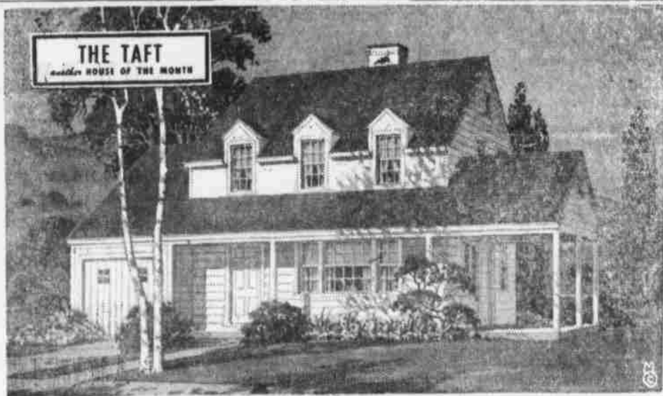
Exclusive Design of Monthly Small House Club, Inc.