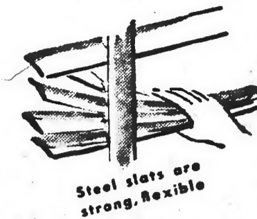
Steel slats are strong, flexible