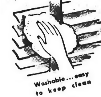
Washable... easy to keep clean