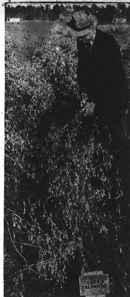
Yelnando Soybeans growing on Coker Farms—Note small percent shattering. Photo taken January 28, 1946.