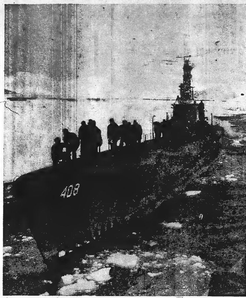
The far-flung activities of American submarines during World War II that brought the undersea craft to the home waters of the Japanese Empire in the van of the fighting fronts, are continued into peacetime as the submarines, like the USS Sennet (above), penetrate the Arctic and Antarctic. Submarines are important units of the Navy's postwar expeditions and projects probing the mysteries of distant oceans for scientific data to be used for future planning.

cleaner and other cleaning equipment is near the place where you use it most often. Keep it in dry bag, a basket, or on round peg, air, not too close to radiators. Heat is hard on rubber parts. Empty your cleaner of dust, or you'll have a grand breeding place for moths. Loosen the cleaner belt if the manufacturer suggests it. Always wind the cord loosely a-