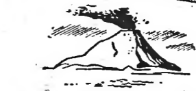
Large Heat Capacity