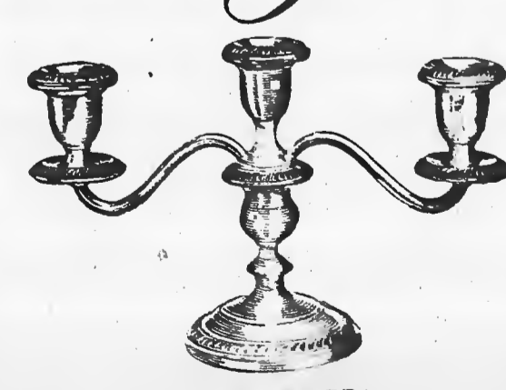
CANDELABRA 6 1/2" high, pair $60.00