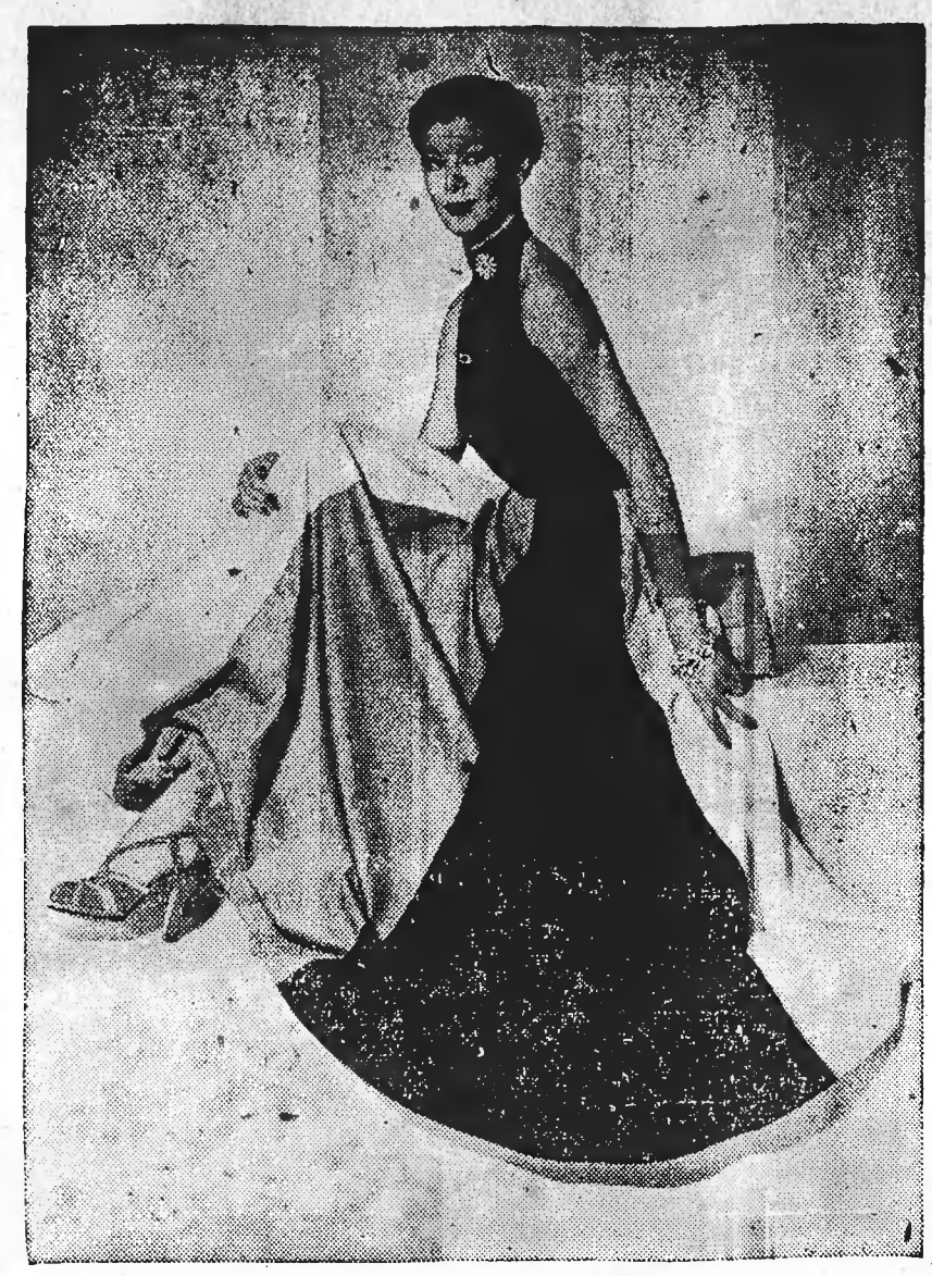
Broad, tri-colored panels in the skirt and a high, choker-type collar on the halter blouse give this evening ensemble a regal air. Made by Lotte of Drewyn from Wesley Simpson's "Rustler" cotton, it was selected by Cosmopolitan magazine editors for a spring wardrobe. The skirt, cut full and long, comes in gray-chartreuse-white, or gray-navy-mauve and sells for about $25. Another $8 buys the blouse, which buttons to the waist and is in gray, chartreuse or mauve solid colors.

day. These cattle, valued at $4500, The others have mixtures represent the crop from one hundred acres of land.