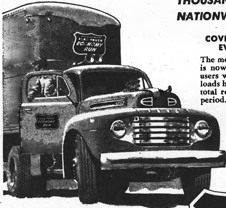
Ford 145-h.p. F-8 Big Job shown has a G.T.W. rating of 39,000 lbs. Over 175 Ford Truck models to choose from! Exclusive choice of V-8 or Six-cylinder truck engines!

DRAMATIC DEMONSTRATION THAT FORD IS AMERICA'S NO. 1 TRUCK VALUE! The Ford Economy Run will demonstrate for everyone to see what Ford owners have known right along. Ford Trucks do more per dollar—in your business, in any business. See us today! Choose from over 175 Ford Economy Truck models!