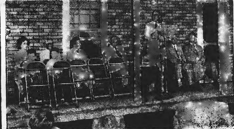
The front porch of the Hicks home, from which ceremonies were broadcast over a State radio network.