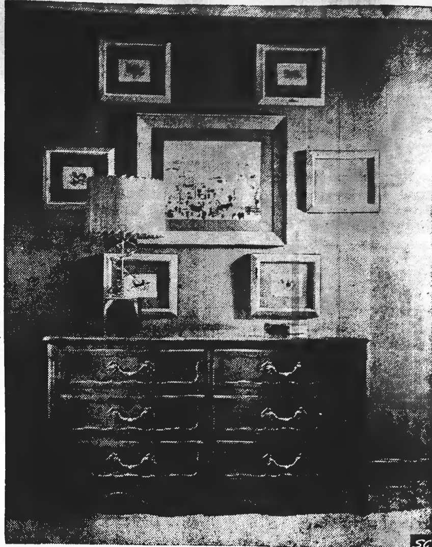
Grand Rapids Guild Room Photo

Let framed pictures be your spokesman in setting the "locale" for your interior decorating scene. Here the French Provincial double chest is appealingly enhanced by these attractive prints arranged to really start tongues wagging about your ingenious "flair" for styling. Against a pine green wall, these pictures, matted with a red background and in frames of natural wood coloring, will create that intangible stamp of taste "unqualified."