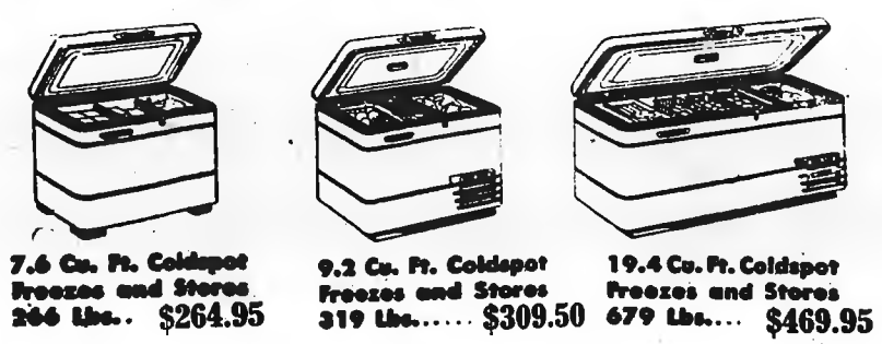
7.6 Cu. Ft. Coldspot Freezer and Storage 266 lbs. $264.95 9.2 Cu. Ft. Coldspot Freezer and Storage 319 lbs. $309.50 19.4 Cu. Ft. Coldspot Freezer and Storage 679 lbs. $469.95