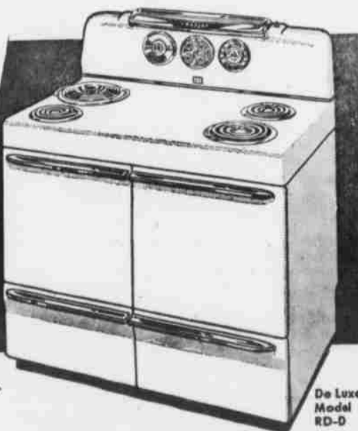
De Luxe Model RD-D

Only CROSLY gives you the SHELVADOR Designed from the Woman's Angle