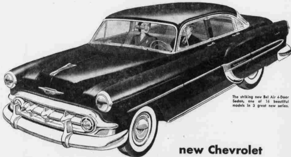
The striking new Bel Air 4-Door Sedan, one of 16 beautiful models in 3 great new series.