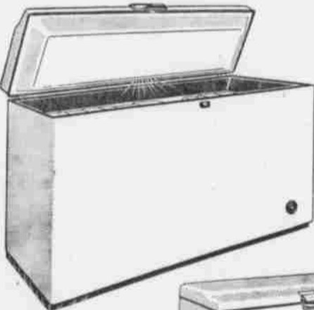
Frigidaire HR-132 holds 462 lbs. of frozen foods.

Yes, a Frigidaire Food Freezer is the modern way to store foods and enjoy wonderful meals the year 'round. It actually puts a super-market right in your kitchen . . . and saves time, work and money!