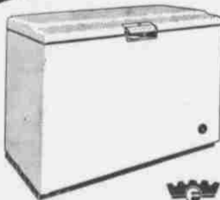
Frigidaire HR-92 holds 322 lbs. of frozen foods.

Take up to 2 years to pay, if you wish. Full terms, or monthly terms. 3 sizes in stock, ready to deliver.