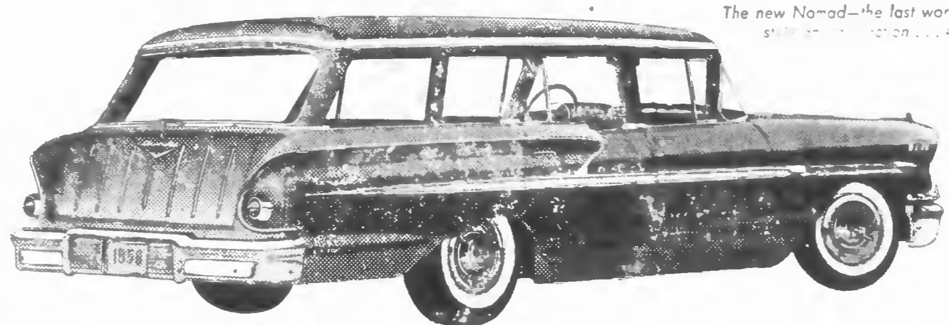
The new Nomad—the last word in station wagon style. 4-door 6-passenger.

ABERDEEN COCA-COLA BOTTLING COMPANY, INC. ABERDEEN, NORTH CAROLINA