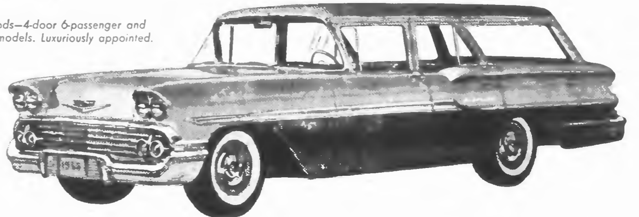
Two new Brookwoods—4-door 6-passenger and 4-door 9-passenger models. Luxuriously appointed.

Meet the year's smartest station wagon set! Chevrolet brings you five new wagons for '58—all long, low and loaded with news. They're more than nine inches longer, dramatically lower. They set a new style with boldly sculptured lines. And these new Chevrolets are the most practical wagons that ever took to the road. The liftgate is hinged into the roof and raises completely out of the way for easier loading. There's a new easy-opening tail-